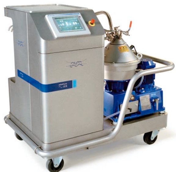
AlfaPure Z3 – a larger separation system from Alfa Laval.

Our total product range includes some 20 separators that also treat wash liquids, oils, other emulsions and paint waste. Alfa Laval is also the world's leading supplier of heat exchangers, helping customers around the world heat, cool and transport any type of fluid.